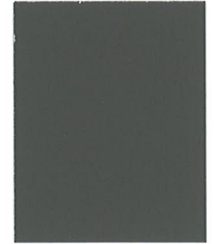
GUNMETAL GRAY 3B