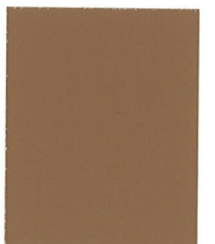
LIGHT MELON 1C