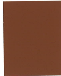
BRICK RED BC-1 CH-00040-60