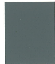
STEEL BLUE BC-4 CH-00232-60