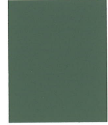
CHARGREEN BC-2 CH-00052-60