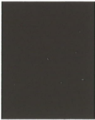
BROWNSTONE BC-1 CH-00038-60