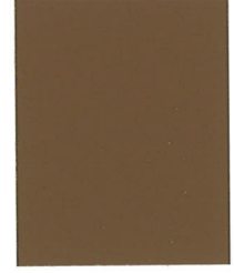
AUTUMN BROWN BC-1 CH-00013-60